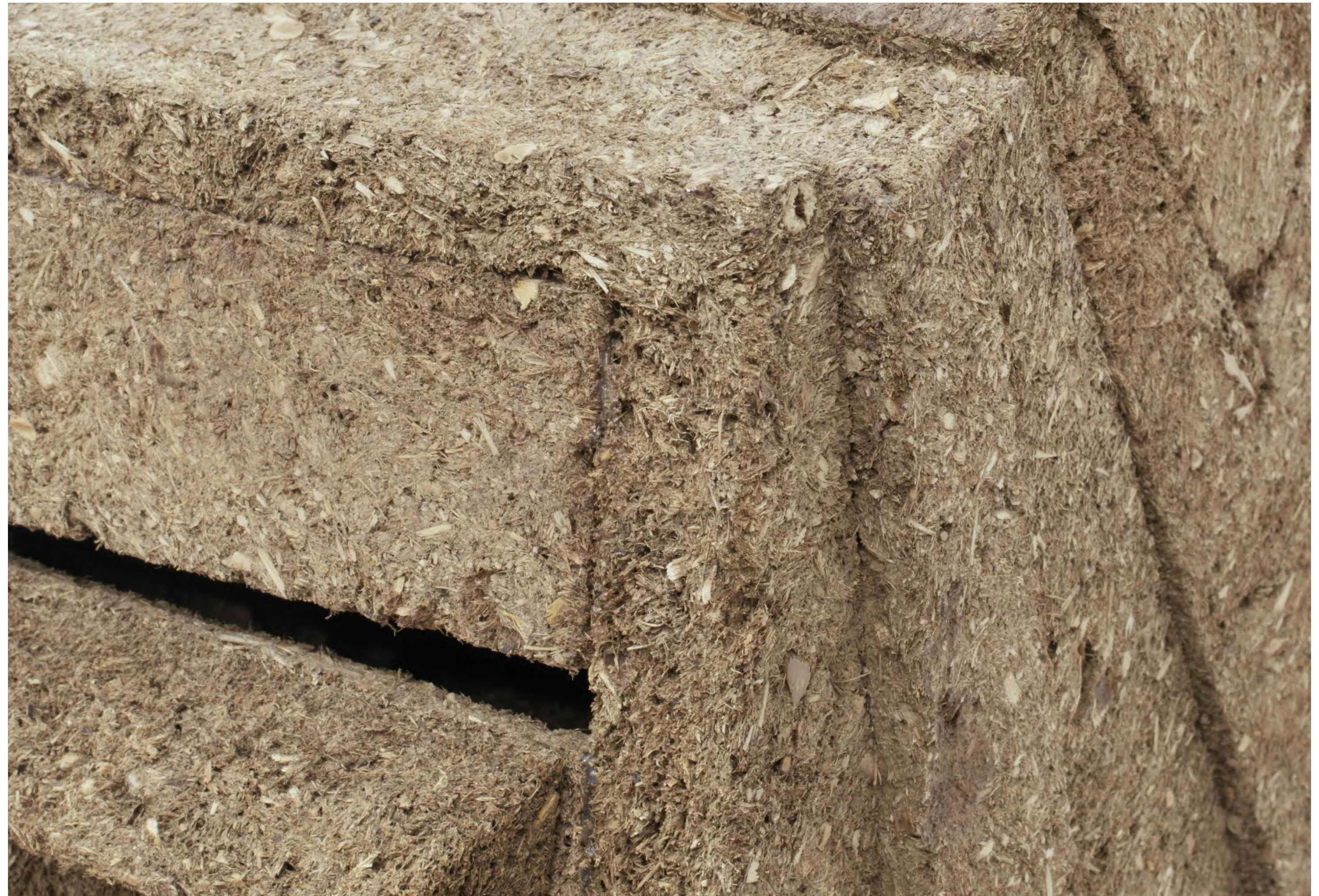
24 – 25 sum, sum, sum Dried cow dung, glue 2023 38 cm × 38 cm × 5 cm